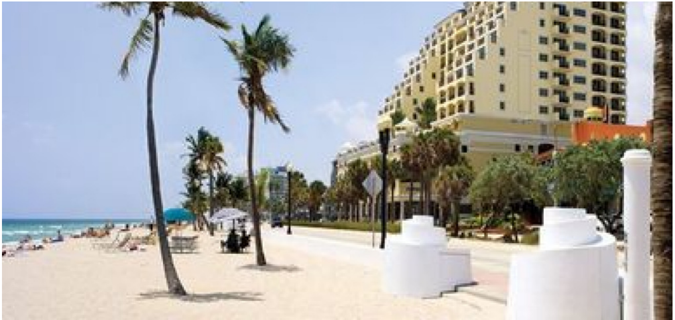
- The Atlantic Hotel & Spa