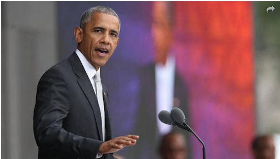
President Obama spoke at the grand opening of the Smithsonian's National Museum of African American History and Culture in Washington, D.C. The museum is the 19th and the newest of the Smithsonians.