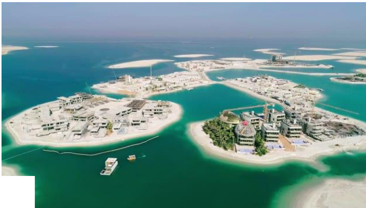
The man-made World archipelago, Dubai