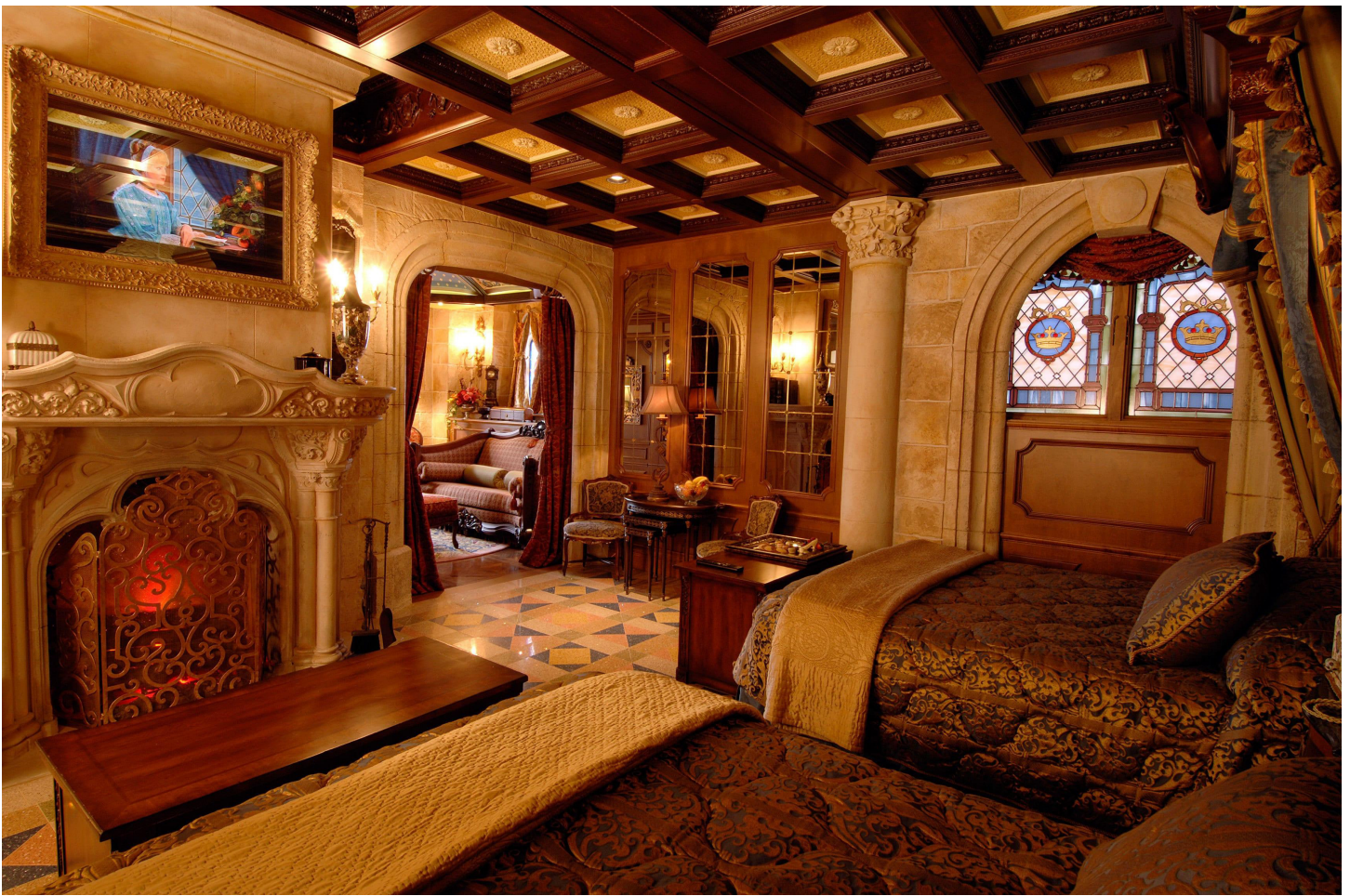
Only a handful of people have ever seen the inside the suite.

The Cinderella Castle Suite is the culmination of every Disney fan's dreams come true. Originally imagined as an apartment for Walt Disney and his family inside Walt Disney World , it remained mainly unfurnished until 2005 when it became a suite fit for a princess.