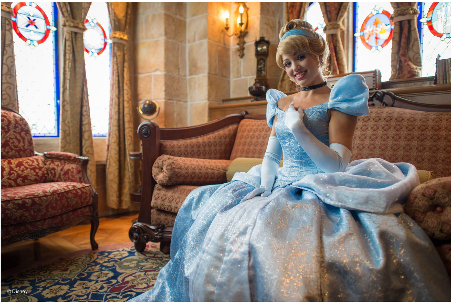
The decor is fit for a princess.

Access to the suite is strictly by invitation-only and previously has only been accessible to occasional competition winners and A-list celebrities . For 14 years, money simply couldn't buy you entrance to the rooms but that's about to change with a new tour geared towards the super-rich.