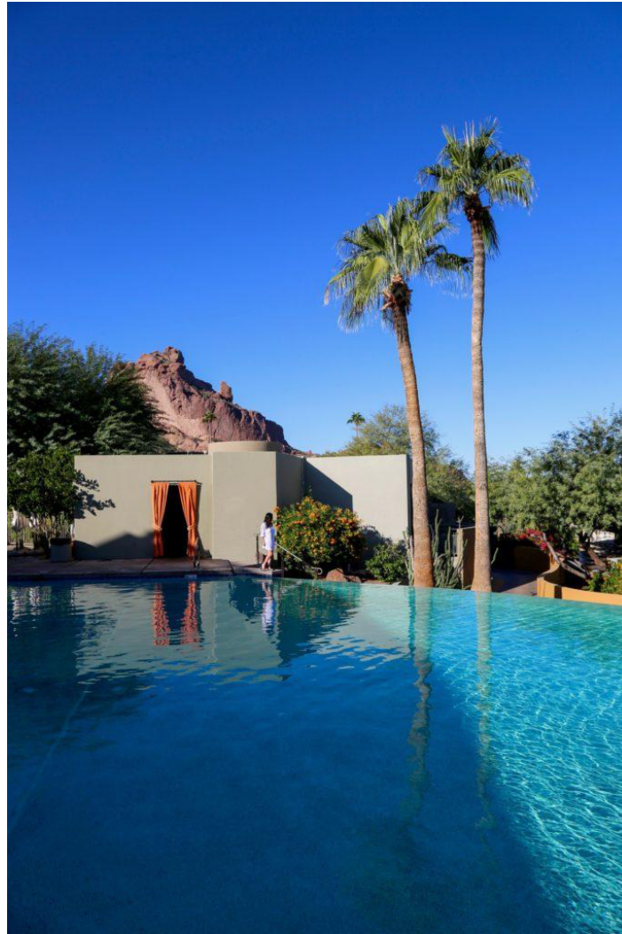
Pool vista from Sanctuary Camelback Resort

I love the detailed design of the resort's architecture and landscaping. What do you think of this pool vista?