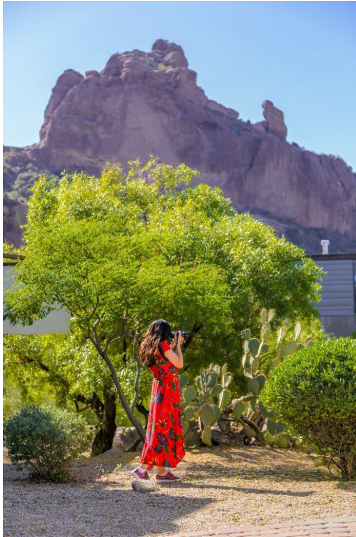
Camelback view from @sanctuaryaz_

This is my Camelback view from Sanctuary Camelback property. @sanctuaryaz The iconic Camelback Mountain is a popular hiking destination. Its jagged profile cuts across the desert landscape of Paradise Valley. During the day, the sunlight intensifies those rich red rocks, and as the sun sets, the lights of the city illuminate the dark sky around it, creating an ethereal glow.