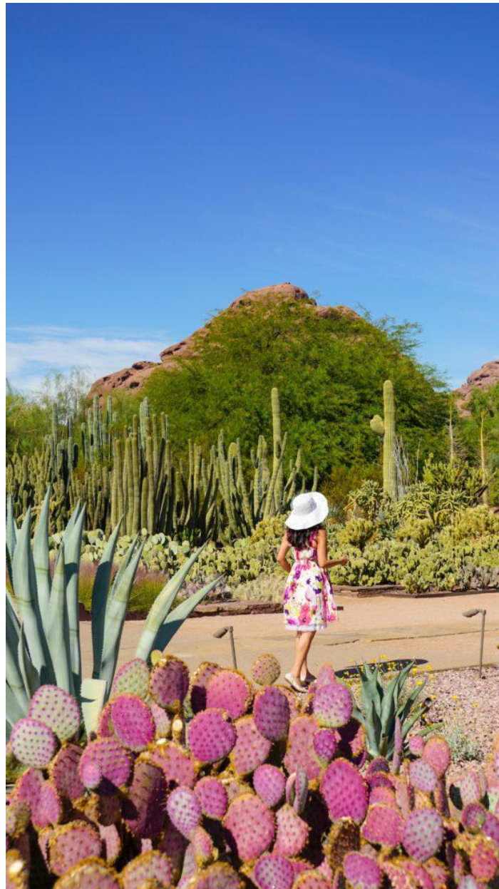
You won't want to miss the Desert Botanical Garden @dbgphx if you are into horticulture.

P.S. Hummingbirds are plentiful at the Desert Botanical Garden.