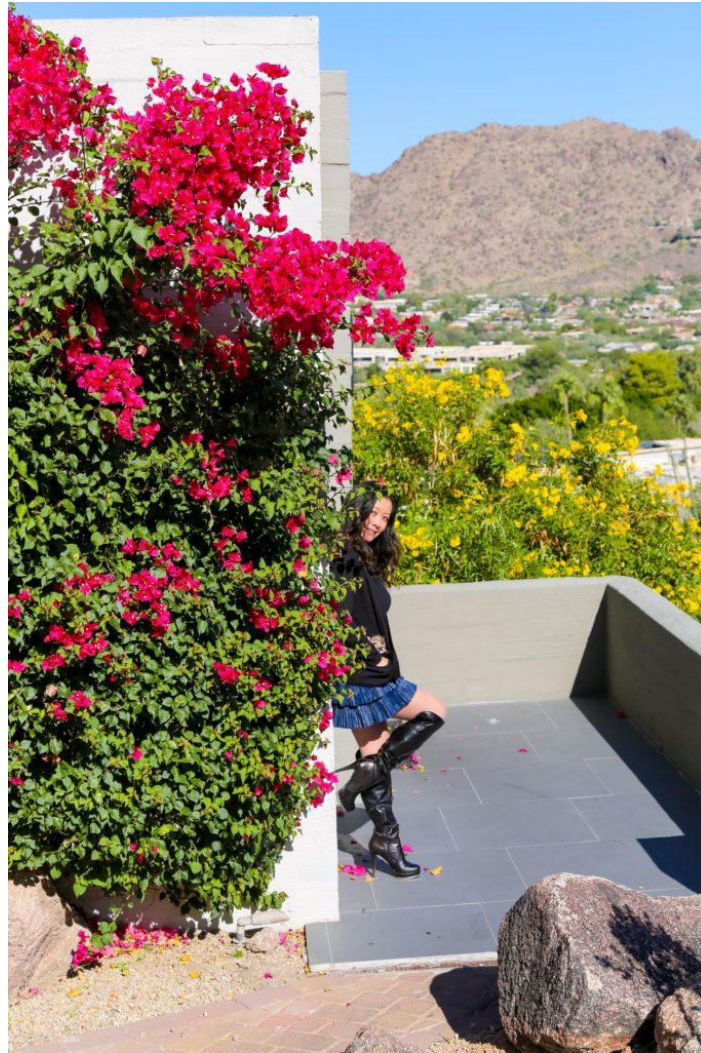
Sanctuary on Camelback Mountain Resort and Spa

If you love bougainvillea, you must tour @visitphoenix. I regret not taking photos with the peach, pink, and other varieties. I guess I was overloaded with the flora the area had to offer. You will find stunning and vibrant colors as you drive to your destination or at your resort.