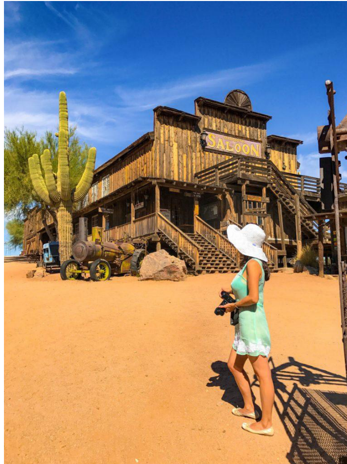
Mammoth Steakhouse and Saloon at the Goldfield Ghost Town in Apache Junction, Arizona, off Route 88.

In case you are wondering about the Elvis Memorial Chapel at Superstition Mountain. It was relocated piece by piece from the old Apacheland movie ranch and still is a location for weddings.