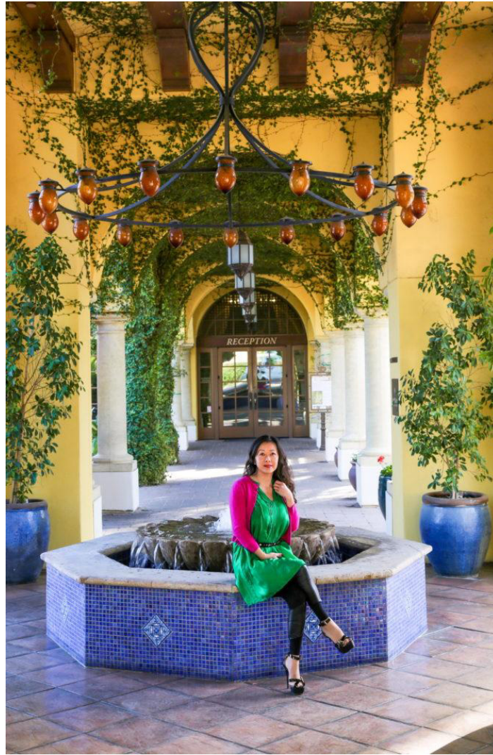
Omni Scottsdale Resort and Spa at Montelucia

Love the fountain and its tile work as well as the floor's. The classic and simple design offers surprisingly diverse ambiances.