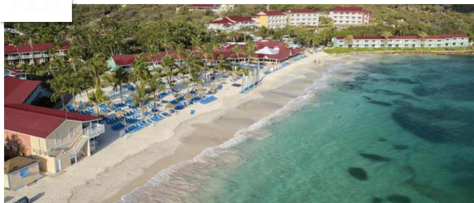
PHOTO: Pineapple Beach Club Antigua.

views. Guests can't leave without personalizing their visit by signing their own small wooden restaurant board.