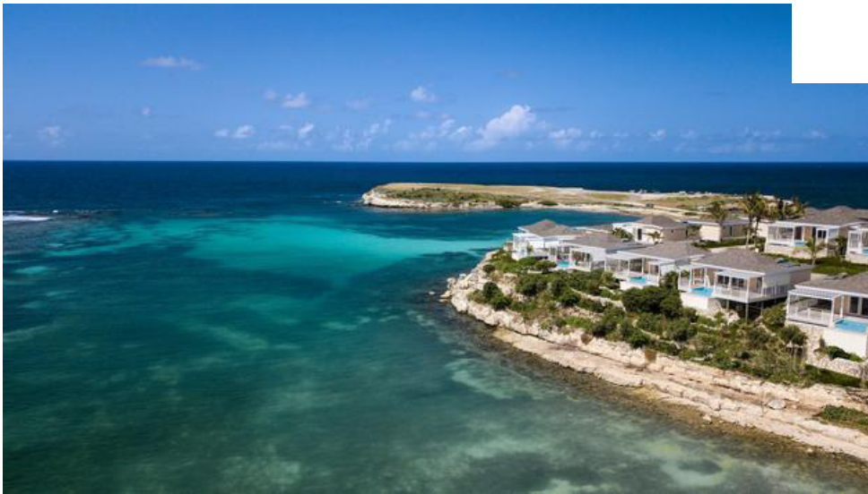
PHOTO: Hammock Cove Resort & Spa. (photo courtesy of Elite Island Resorts)

HOTEL &amp; RESORT | ELITE ISLAND RESORTS | BRIAN MAJOR | DECEMBER 20, 2019