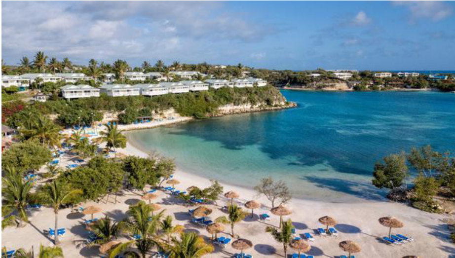
PHOTO: The Verandah Resort & Spa. (photo courtesy of Elite Island Resorts)

This 186-room resort adds another upscale beachfront property to the EIR portfolio, with features designed to satisfy vacationers of all ages. Two-bedroom villas offer private plunge pools, and facilities and services include four restaurants, a coffee and pastry shop, a kid’s club with a pirate ship playground and splash pool a full-service spa and even an 18-hole mini-golf course.