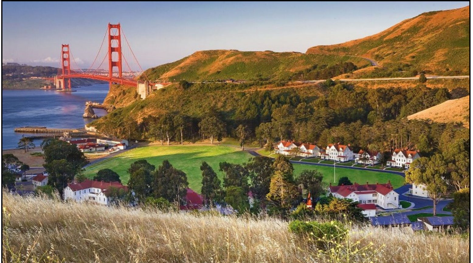
CAVALLO POINT LODGE