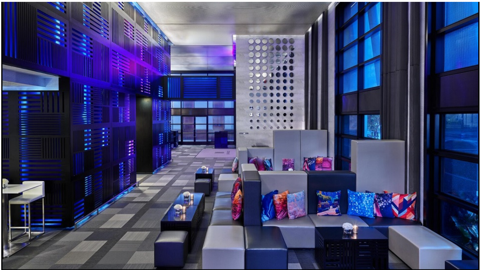
W HOTEL SAN FRANCISCO