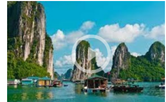
Meet the founder of Vietnam's largest and leading tourism group: TMGroup