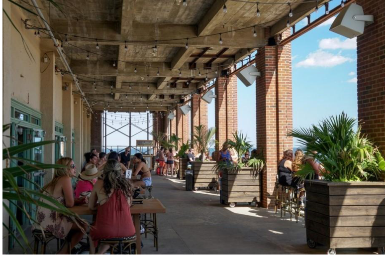
Above: Asbury Park.

Other cities with beaches include the lively Wildwoods , Seaside Heights with its two amusement piers, family favourite Ocean City and trendy Asbury Park all of which feature fun-filled boardwalks with entertainment, rides, shopping and dining.