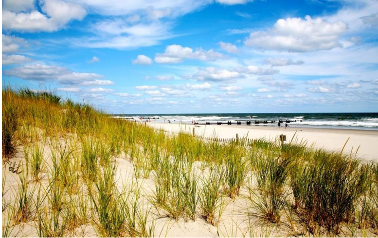
Above: Stone Harbor beach

Sedate Cape May is a charming town located at the southernmost point of the Jersey Shore, with a world renowned architectural legacy, many of its colourful Victorian homes (“Painted Ladies”) have been turned into boutique bed & breakfasts. Cape May is also home to grand Congress Hall which is America’s oldest seaside resort, dating back to 1816.