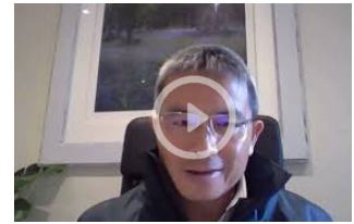
What to expect as Vietnam reopens its border to international arrivals

Sedate Cape May is a charming town located at the southernmost point of the Jersey Shore, with a world renowned architectural legacy, many of its colourful Victorian homes (“Painted Ladies”) have been turned into boutique bed & breakfasts. Cape May is also home to grand Congress Hall which is America’s oldest seaside resort, dating back to 1816.