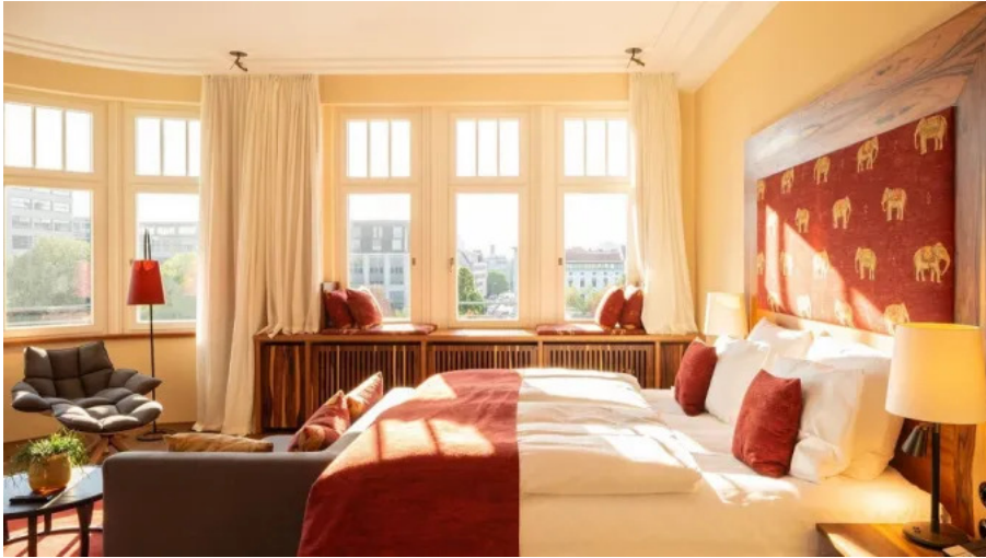
Etihad Airways A380 First Class trip