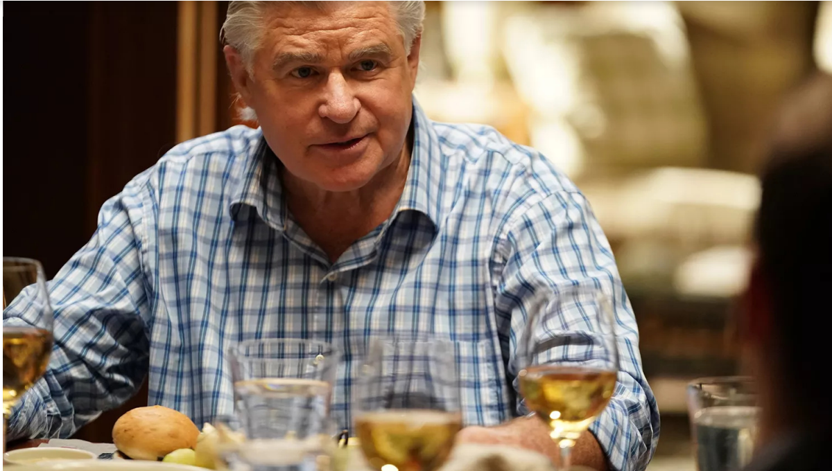
Treat Williams on 'Blue Bloods'.

The actor's longstanding career dates back to 1975 , when he made his film debut in the thriller Deadly Hero . From there, he began to take on more film roles, including 1976's The Ritz and The Eagle Has Landed .