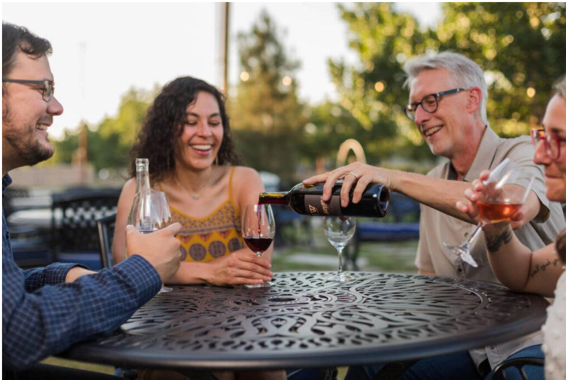
Rio Grande Winery

Enjoy a variety of award-winning wines from the oldest wine-producing region in the nation. Whether sampling red or white wines, groups will find flavors to suit every taste in Las Cruces. Tour vineyards, sip by the glass or plan a tasting to discover the longstanding tradition of New Mexico wine.