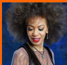
CINDY BLACKMAN SANTANA