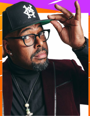
CHRISTIAN MCBRIDE INSIDE STRAIGHT