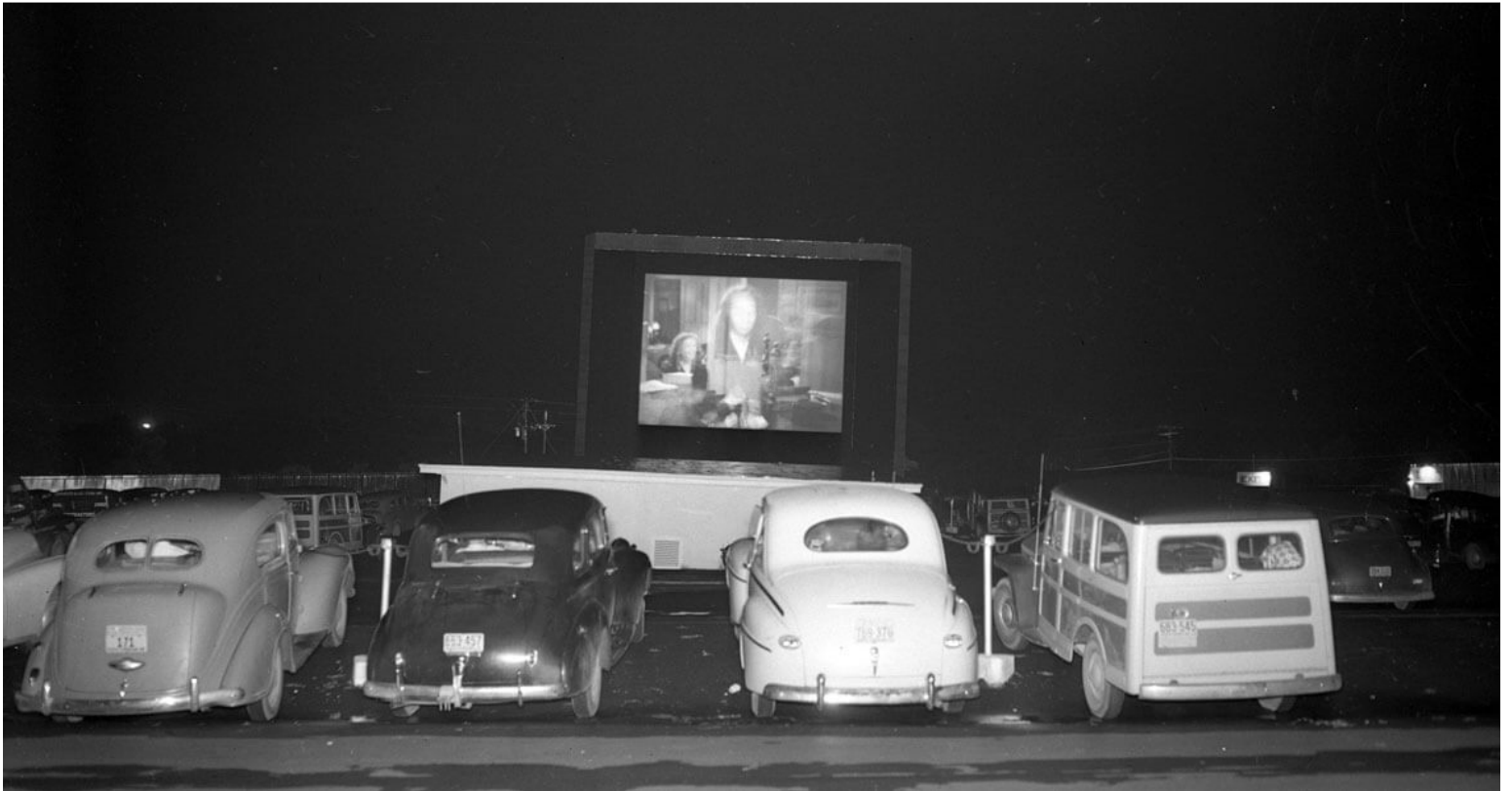
Line up at the drive-in theater with plenty of snacks.

9. Watch a classic movie at a drive-in theater .