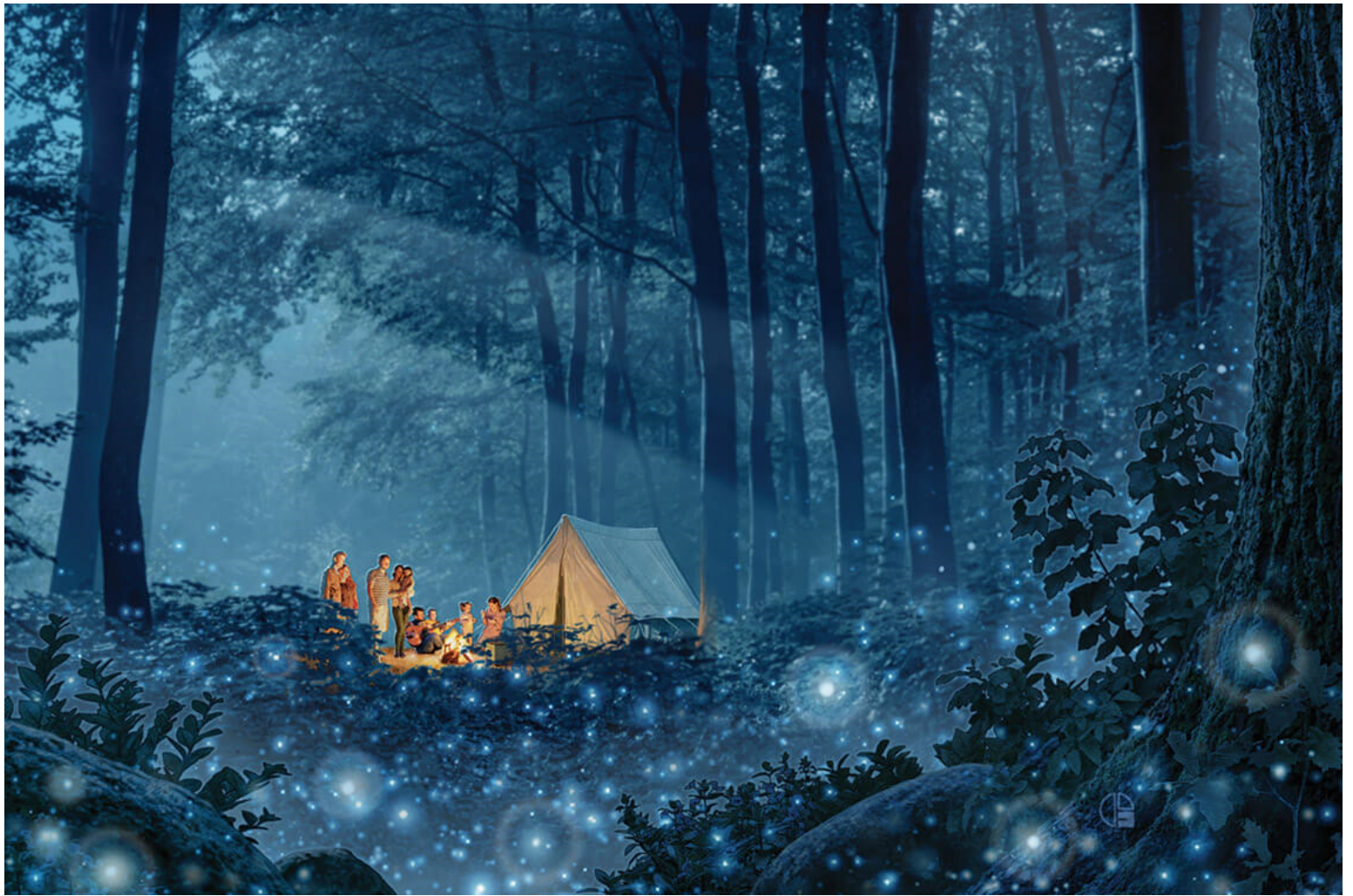
ILLUSTRATION BY PATRICK FARICY

14. Eat a juicy tomato sandwich . Soft bread. Duke's mayo. Salt and pepper. Enough said.