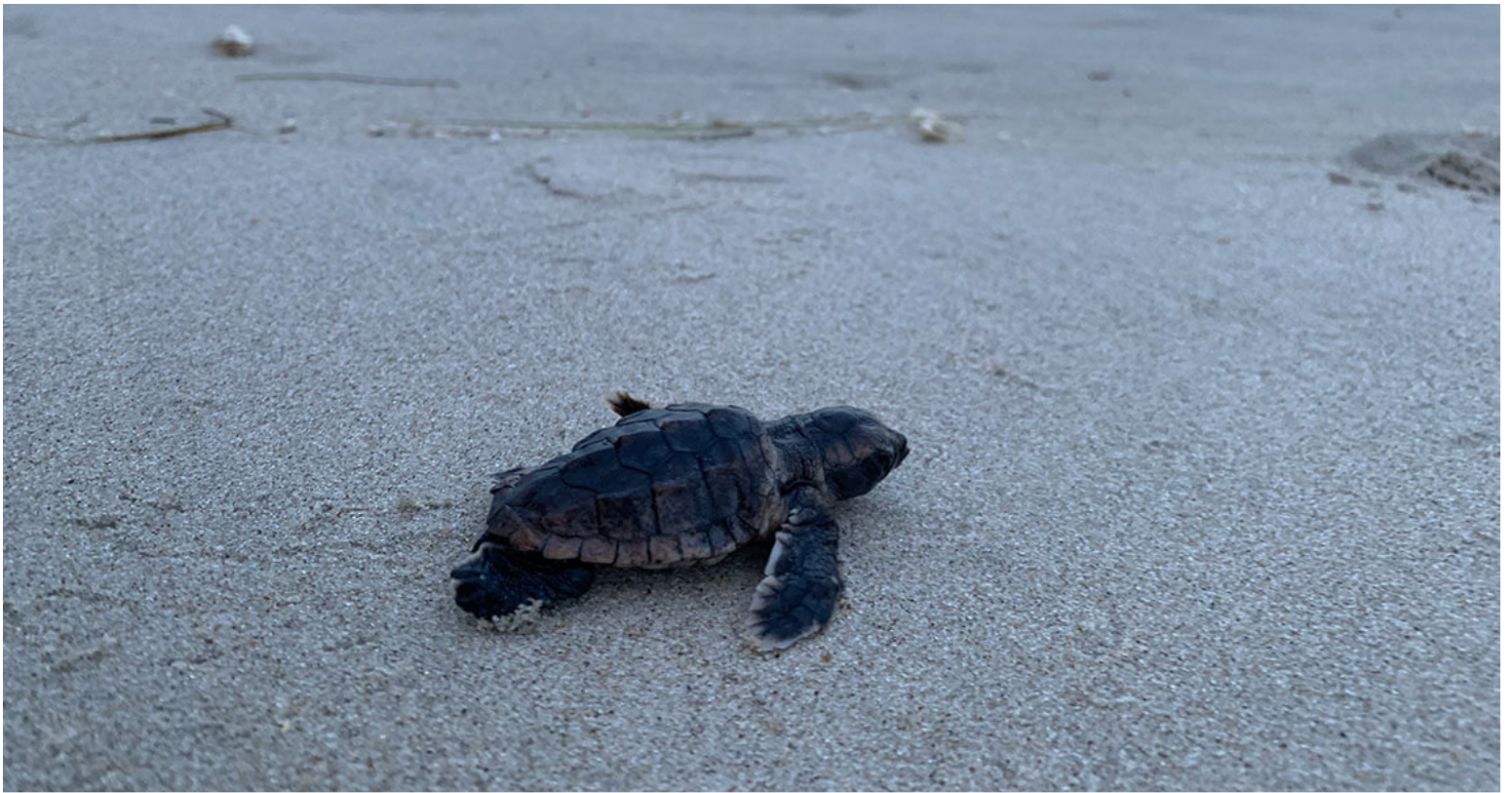
Loggerhead sea turtles hatch on the beach before scurrying quickly to the surf.