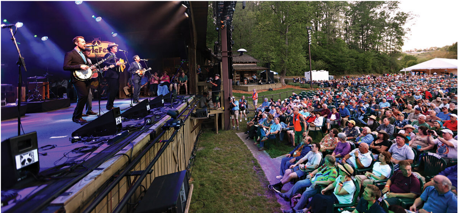
The Steep Canyon Rangers are a Grammy Award-winning bluegrass band from North Carolina.