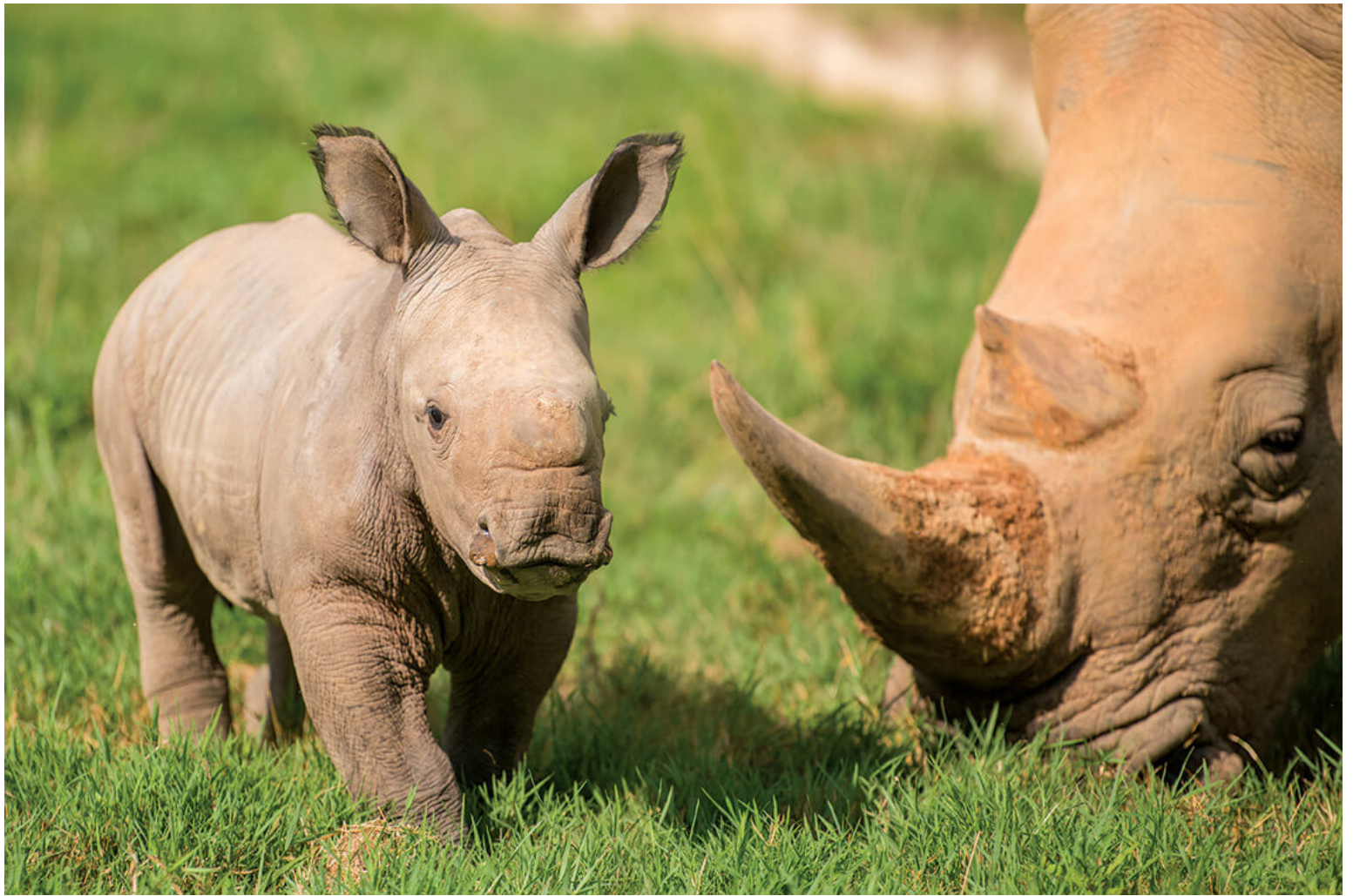
Southern white rhinoceros Linda and her daughter, Nandi, graze on the Watani Grasslands.

25. Watch the sunrise from Clingmans Dome.