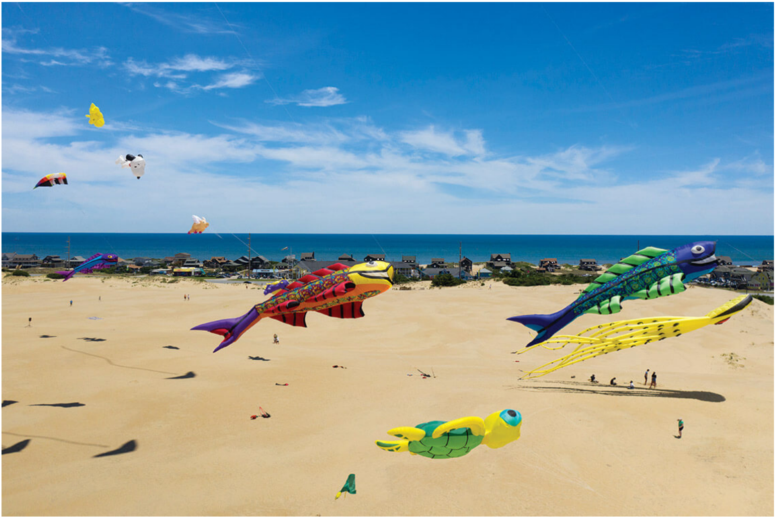
Massive creatures glide over Jockey's Ridge during the Outer Banks Kite Festival.