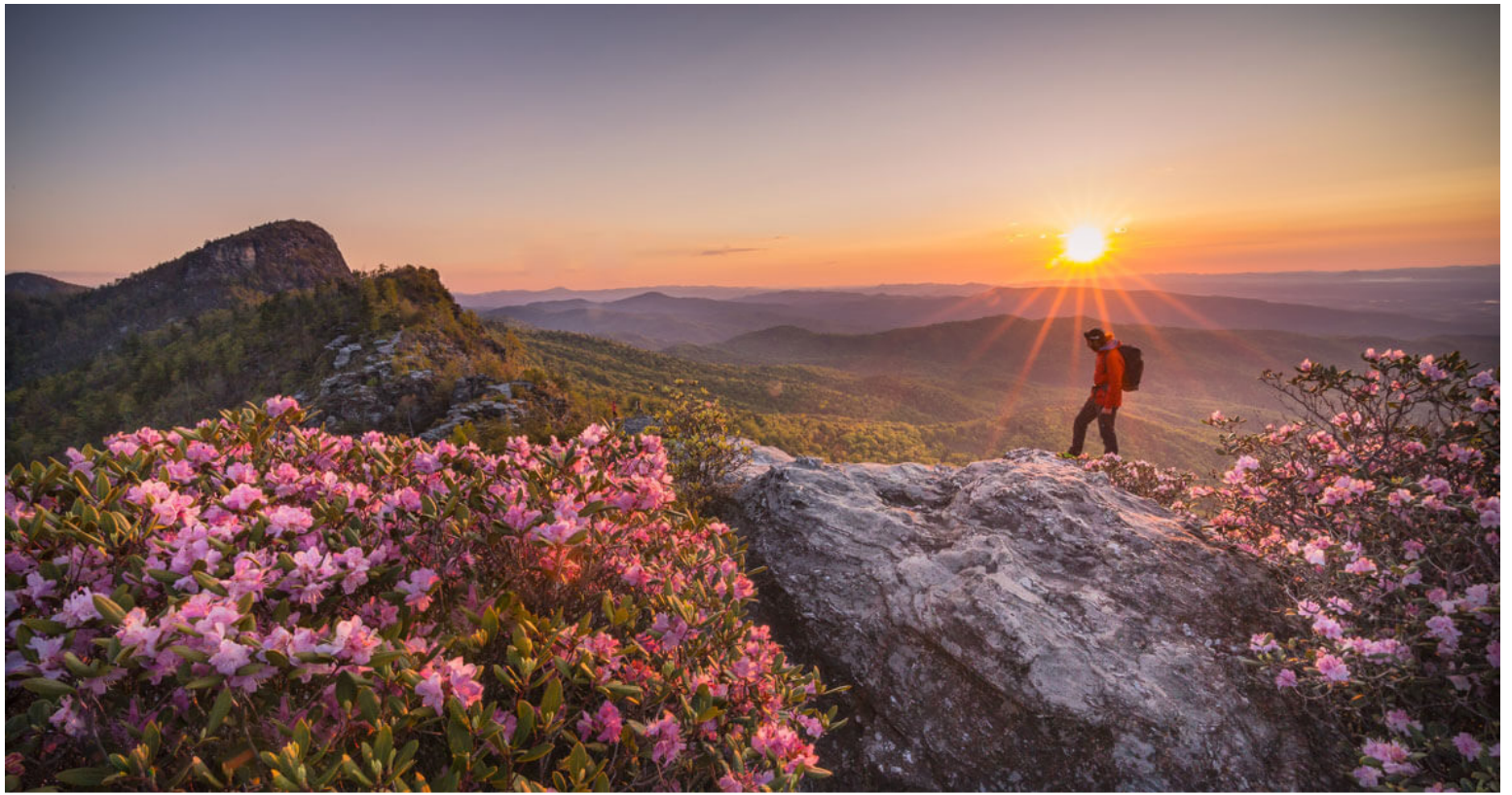
An overlook at the Linville Gorge, along the Mountains-to-Sea Trail.