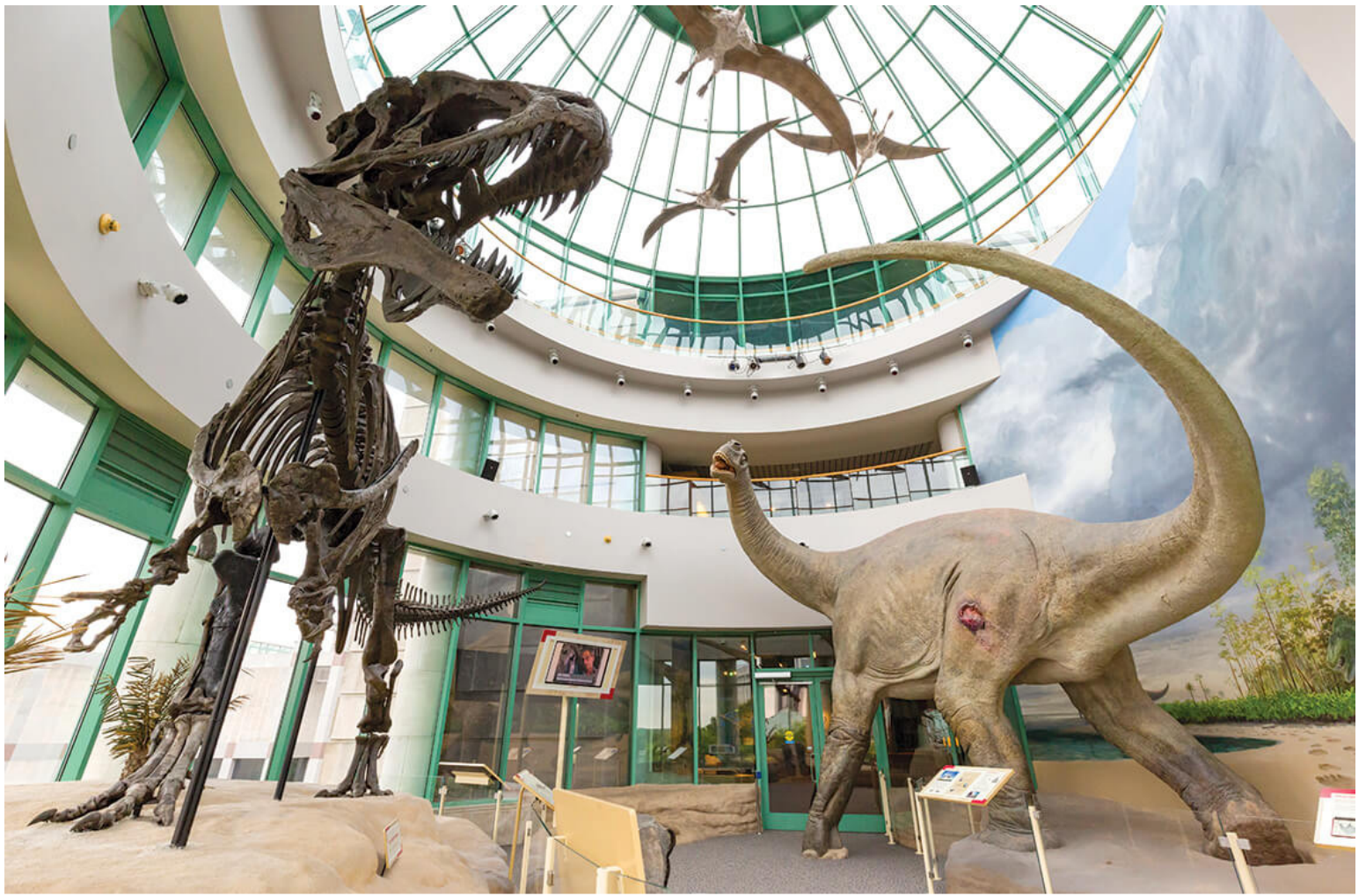
In the “Terror of the South” exhibit at the Museum of Natural Sciences, an Acrocanthosaurus (left) battles a sauropod while pterosaurs circle overhead.