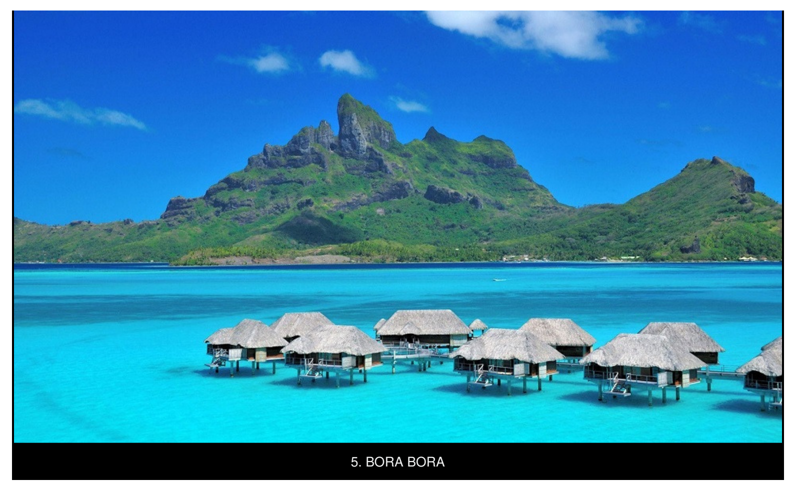
*** Follow me on Instagram, YouTube, X (Twitter) or Facebook for a daily moment of travel inspiration ***