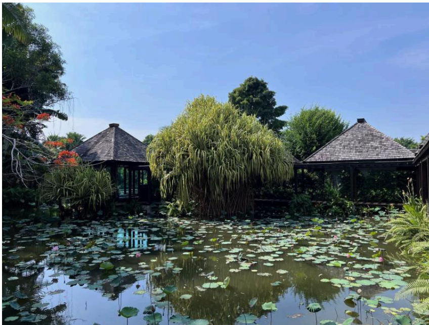
The dreamy spa at the Anantara Mai Khao Phuket was one of the filming sites for Season 3 of "The White Lotus."

destinations. Travelers sign up as a Cathay member (it's free) and use code WL25US at checkout. That airline promotion is valid now through May 30, 2025.