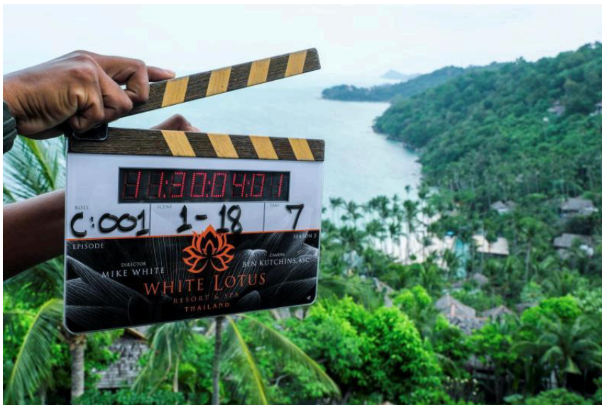
Filming for the HBO Original series, "The White Lotus," unfolded at multiple luxury properties and scenic destinations within Thailand.