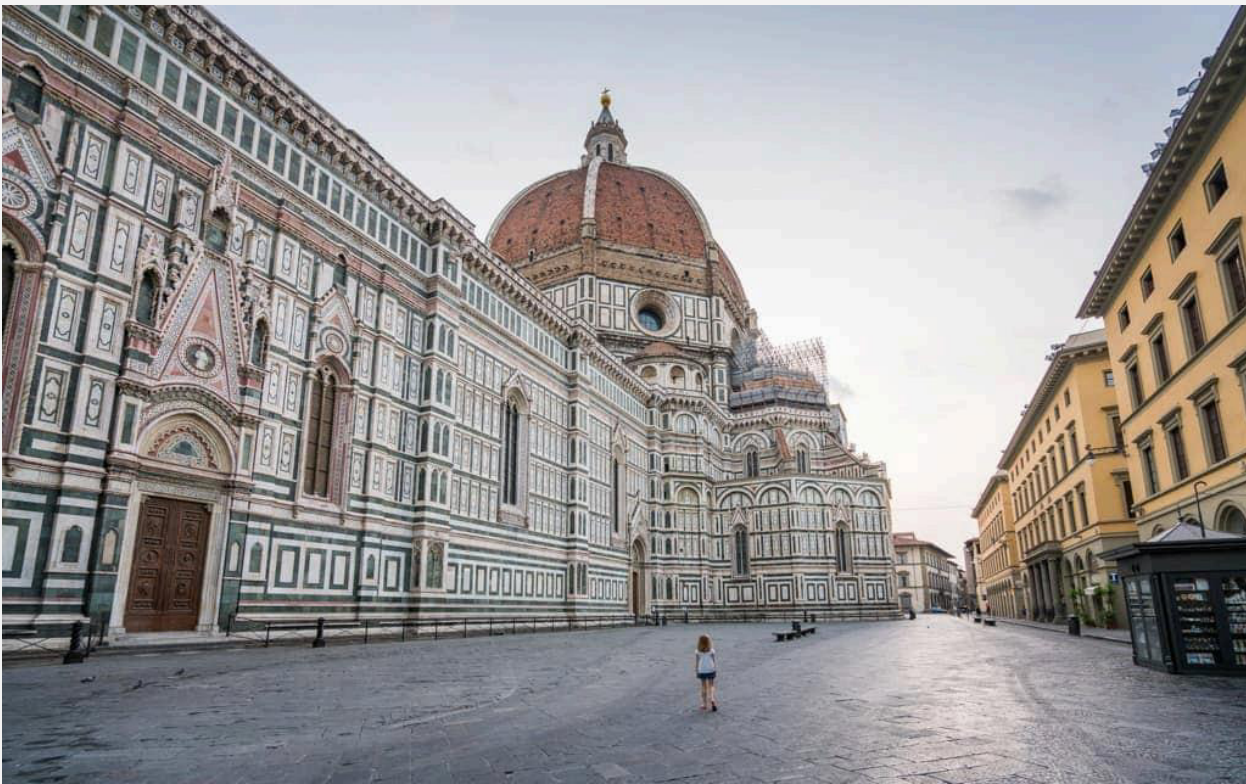
Early morning in Florence