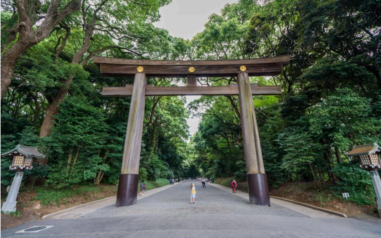
A torii gate near Tokyo's Meiji Shrine

Visit Tokyo for the skyscrapers, the arcades, the anime, the iconic Park Hyatt Tokyo , and the amazingly hectic pace of the city, but head to the gardens, temples, and parks as well to see Tokyo's more relaxed side.