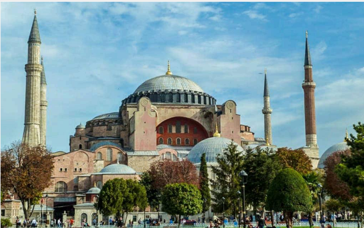
Istanbul's Hagia Sophia.

There are countless reasons to visit Istanbul : the hills; the Bosphorus; the Blue Mosque; Hagia Sophia; the Grand Bazaar; its amazing history and importance on the Silk Road. It's Asian and European, secular and devout. And everything comes together magnificently.