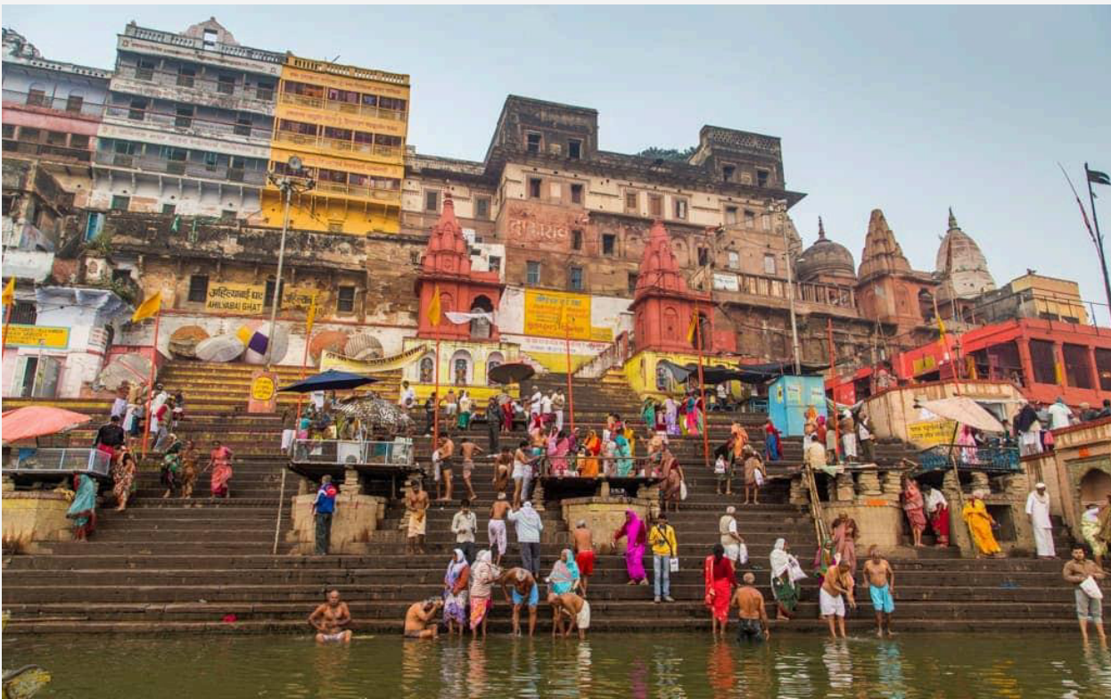
Morning along the Ganges in Varanasi