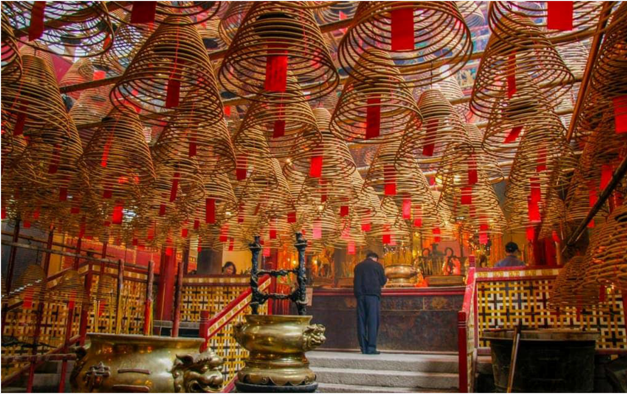
Hong Kong's Man Mo Temple

I almost included Beijing instead, but Hong Kong is easier to visit (no visa required), and is more compact and easier to explore. We love hiking on Lantau Island, watching the city light up at night from Victoria Peak, smelling the incense in the temples, and taking in both sides of the city from the Star Ferry – still the best $0.25 you can spend anywhere.