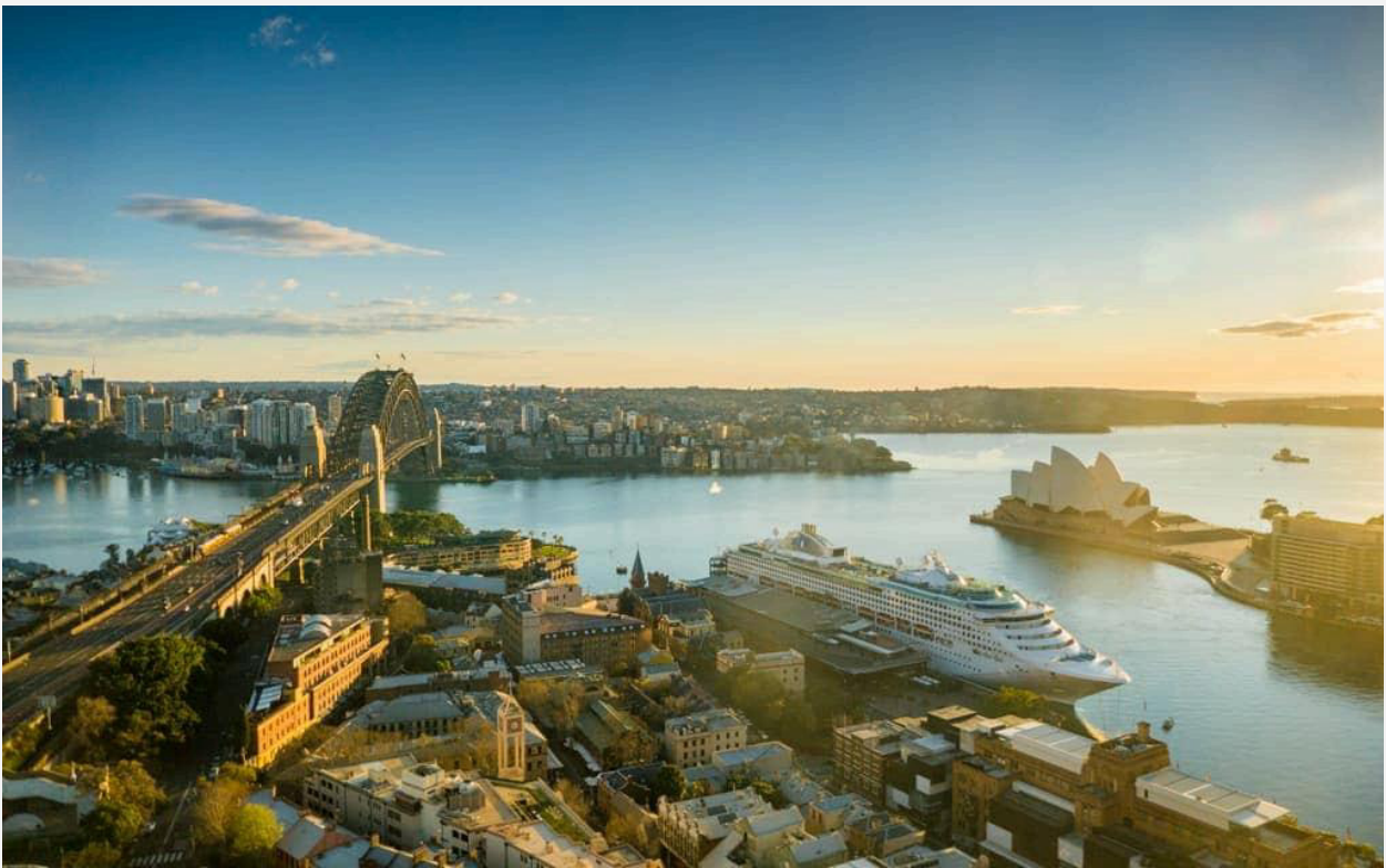
Sydney's Harbour Bridge and Opera House as seen from the Shangri-La Hotel

What are your bucket list cities? Get started planning your escape to your favorites here!