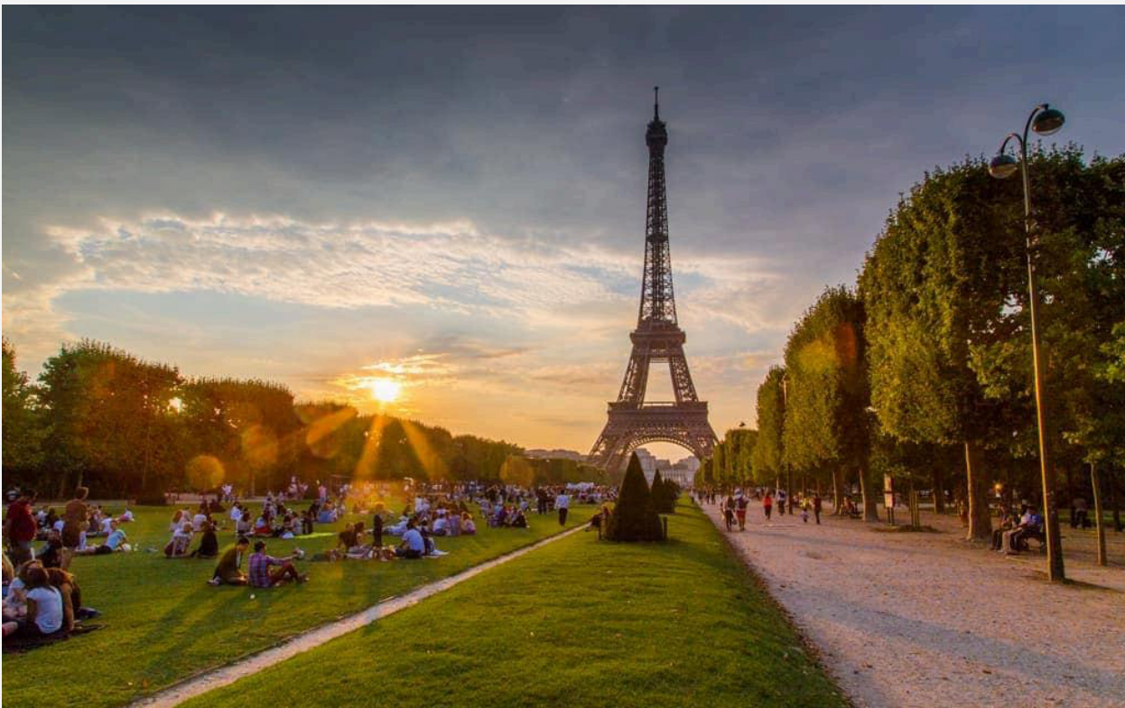
Nothing beats a sunset picnic at Champ de Mars park