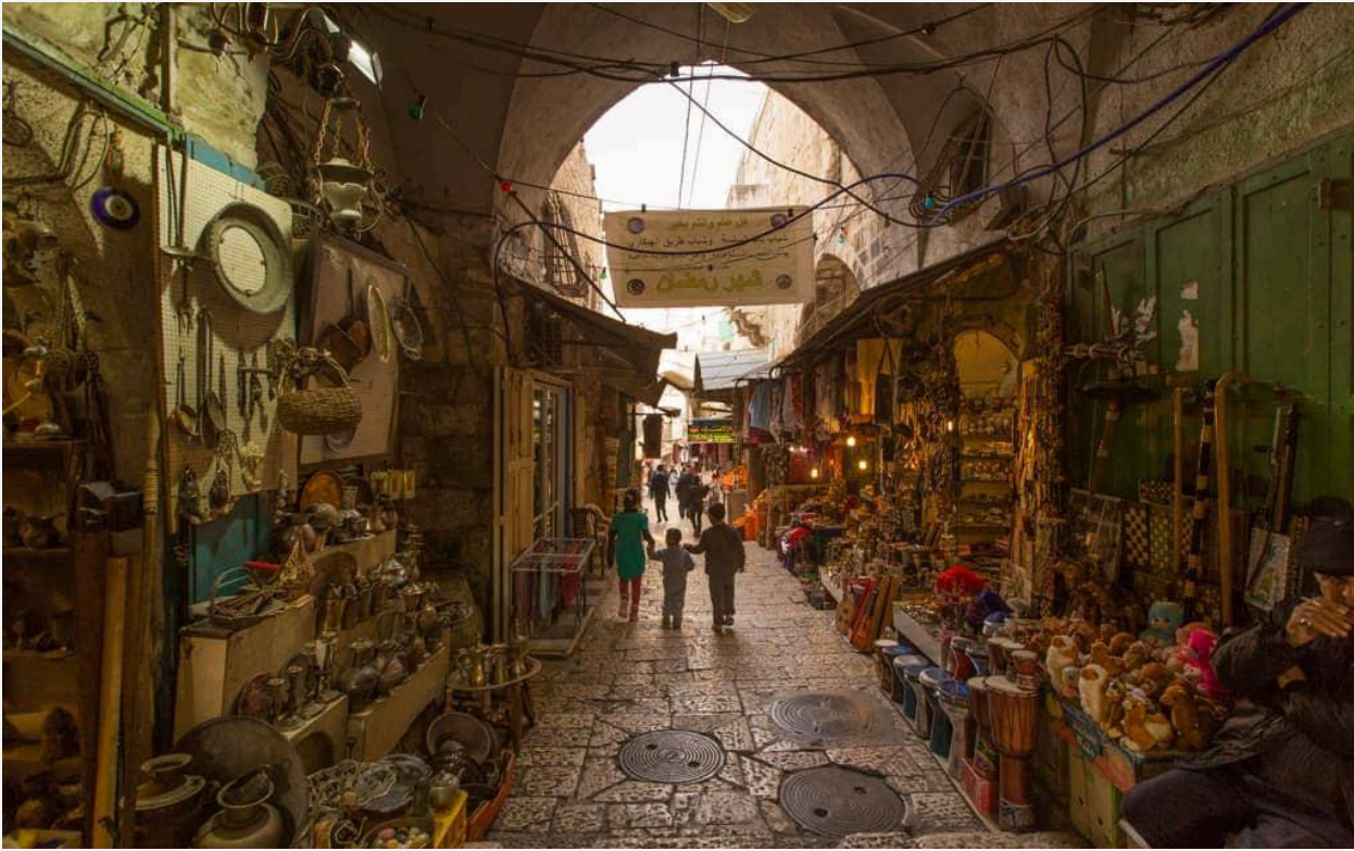
In Jerusalem's Old City

One of the oldest cities in the world, Jerusalem is key to Islam, Judaism, and Christianity. In entering the Old City, you leave behind the 21st century, and when you walk from the Jewish quarter to the Muslim quarter, you may as well be traveling to another country. Utterly fascinating to visit and experience, regardless of your religious beliefs.