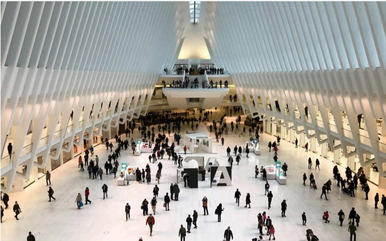
The Oculus – New York City's transportation hub at the World Trade Center

From morning to night, New York City has an energy unlike anywhere else on the planet. Visit Central Park, head to the Metropolitan Museum of Art, eat a hot dog from a street cart, dine at a Michelin-starred restaurant, look out over the Statue of Liberty, and see a Broadway show ... all in the same day.