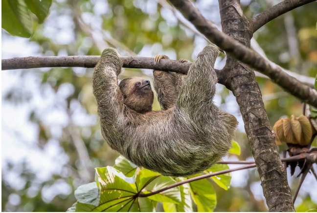
Sloth hanging from a tree.

Fox35 noted that the other 10 sloths died from unspecified reasons, with the animals arriving in two separate shipments in December 2024; one from Guyana, and another from Peru.