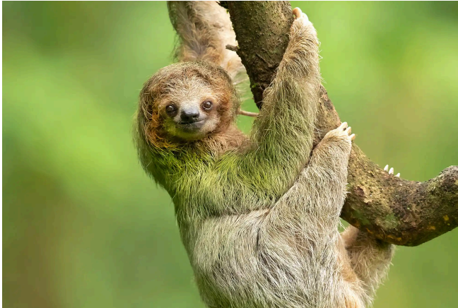
A sloth on a tree branch.

Entertainment Weekly has reached out to Sloth World and the FWC for comment.