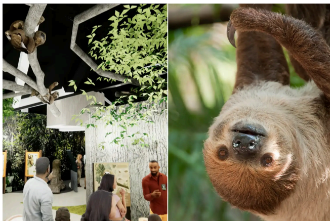
31 sloths die in the care of Orlando Sloth World attraction.